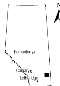
Figure 1. Suffield Base